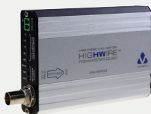
HIGHWIRE POWERSTAR QUAD is also available with 4-port POE switch